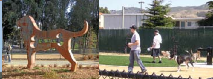
▲ Centennial Dog Park