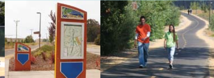
▲ Way-finding Kiosk